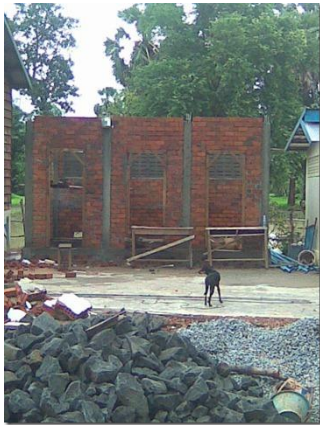
From left to right – Second toilet block Mkak Primary School, SFODA resources, Pichey Rangsey school flooring, Laptop for Sangkal School

Humanitus would like to acknowledge and thank all those who have helped with our fundraising efforts. Funds were raised and goods donated throughout the past year not only from our Nov 2010 fundraising event at Xavier's Billilla Mansion along with private, corporate and board member donations, but also Caulfield Grammar School (Malvern Campus), National Australia Bank and the Victorian Primary Years Network (PYP) have been very generous in their support and for their contributions we are all extremely grateful. A special thank you goes out to CGS Years 3 – 6 students, their teachers and families.